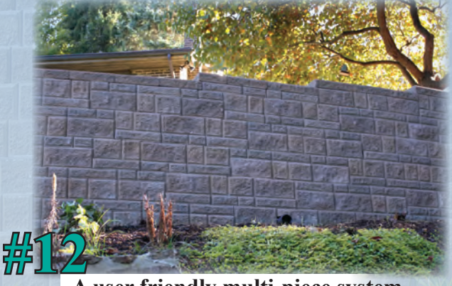
A user friendly multi-piece system called the Gettysburg.