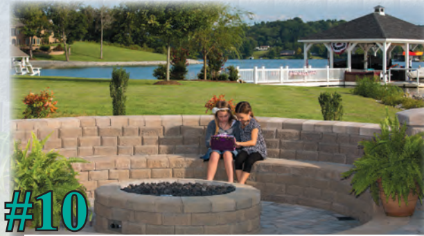
Superior WeatherDome® arched caps (or conventional flat caps)

Corners with controlled outside vertical edge